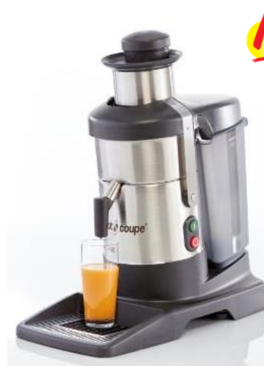
J 80 Buffet