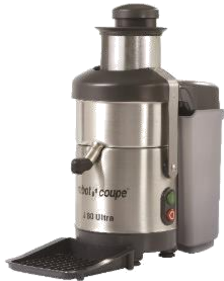
J 80 Ultra