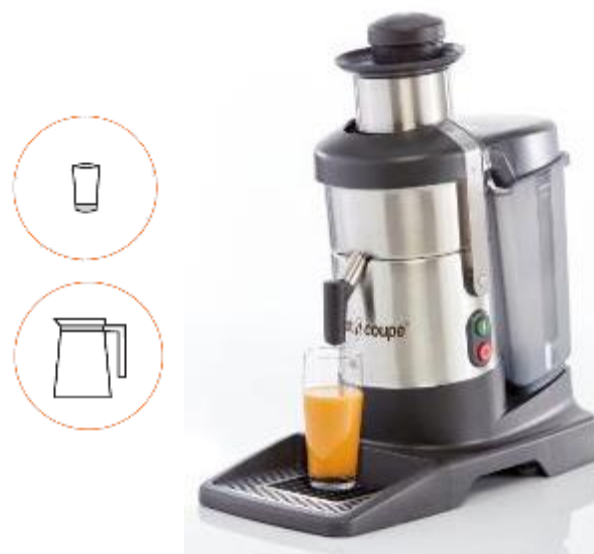
J 80 Buffet